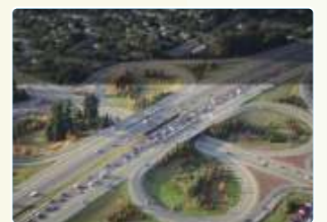
Outer Ring Roads