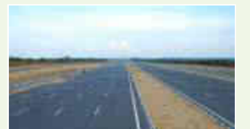
Outer Ring Road